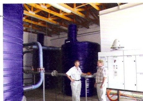
Water Sewage & Effluent Archives