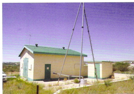
Water Sewage & Effluent Archives